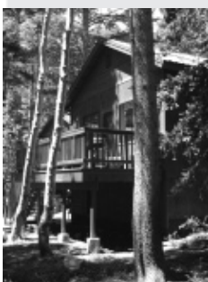
Rock Creek Lakes Resort Cabin to the left and Boat Dock below.